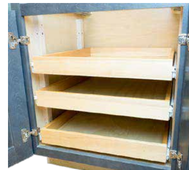
Figure A Holds up to (3) POS's